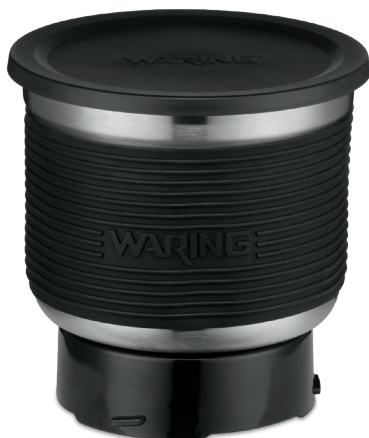
CAC128 Stainless Steel Bowl with Lid